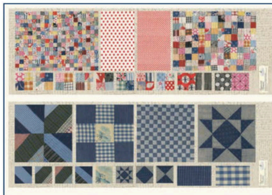
Patchwork Panel Postage Stamp Retro ABTT201